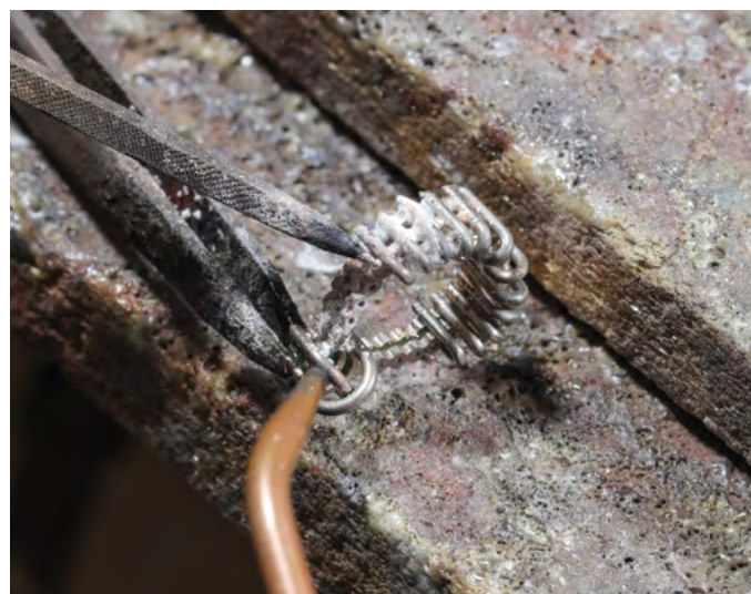
Soldering on the claws of the earrings

"... they will have more value set into a piece of jewellery that you can wear and enjoy ..."