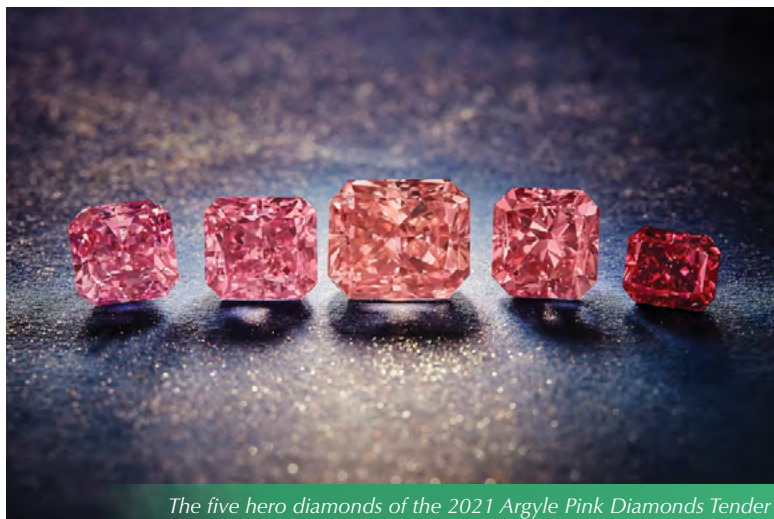
The five hero diamonds of the 2021 Argyle Pink Diamonds Tender

FGAA Dip DT Regt Valuer RV348 Office Manager