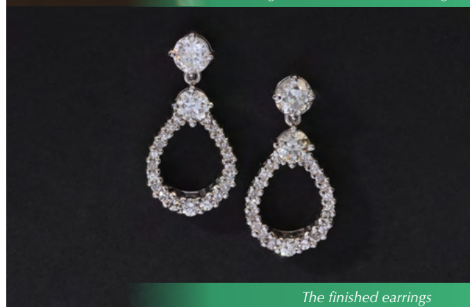
The finished earrings