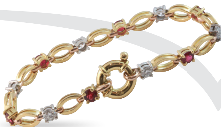
Handmade ruby and diamond bracelet, helping a favourite couple to celebrate their 50th wedding anniversary