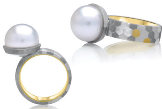
Pearl ring – 'Saturn's Storm' 18 carat yellow, white gold and silver, forming hexagon tiles. Yuki's entry into the Cygnet Bay pearl design competition