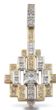
Art deco two-tone pendant design, a fine use of our customer's diamonds